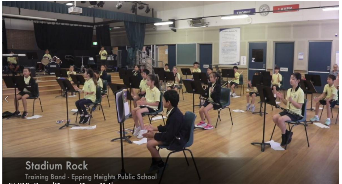
Stadium Rock Training Band - Epping Heights Public School