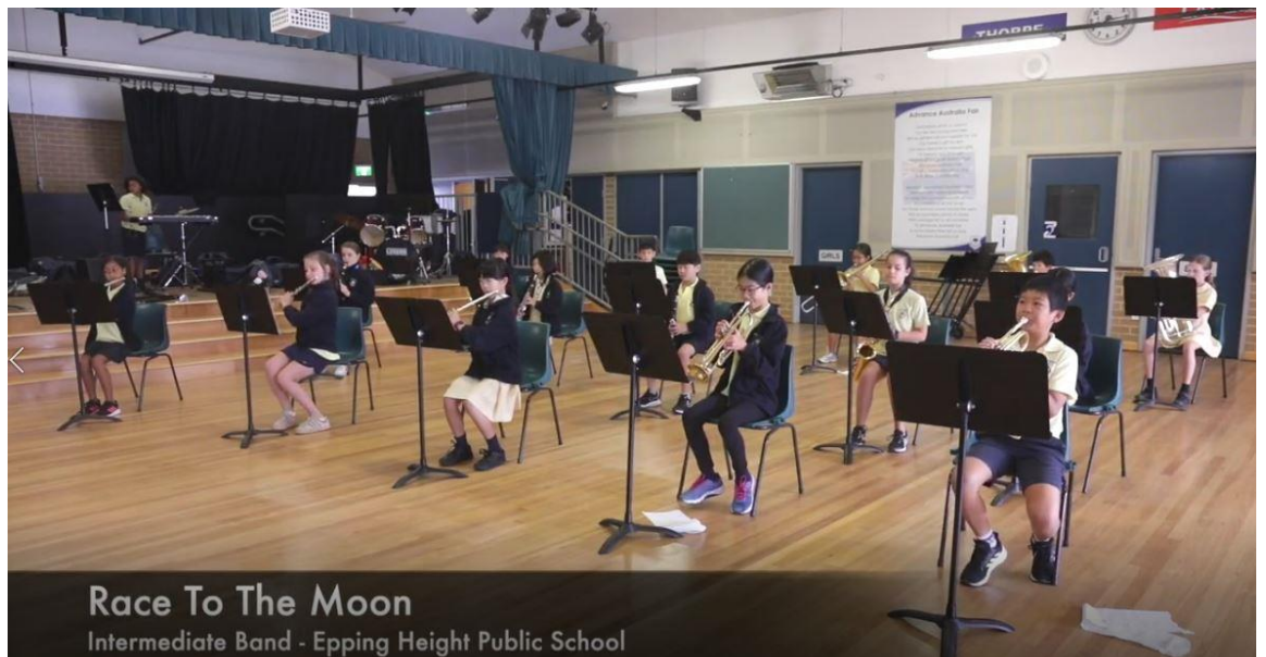
Race To The Moon Intermediate Band - Epping Height Public School