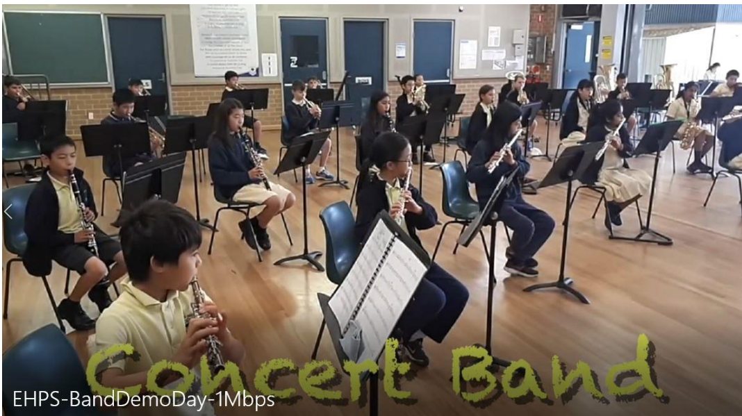
Concert Band EHPS-BandDemoDay-1Mbps