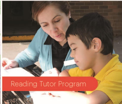
Reading Tutor Program