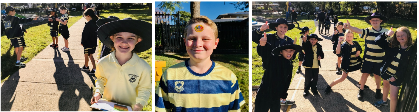
The SRC Representatives

It was great to see everyone's smiling faces at the gates after they had walked safely to school!