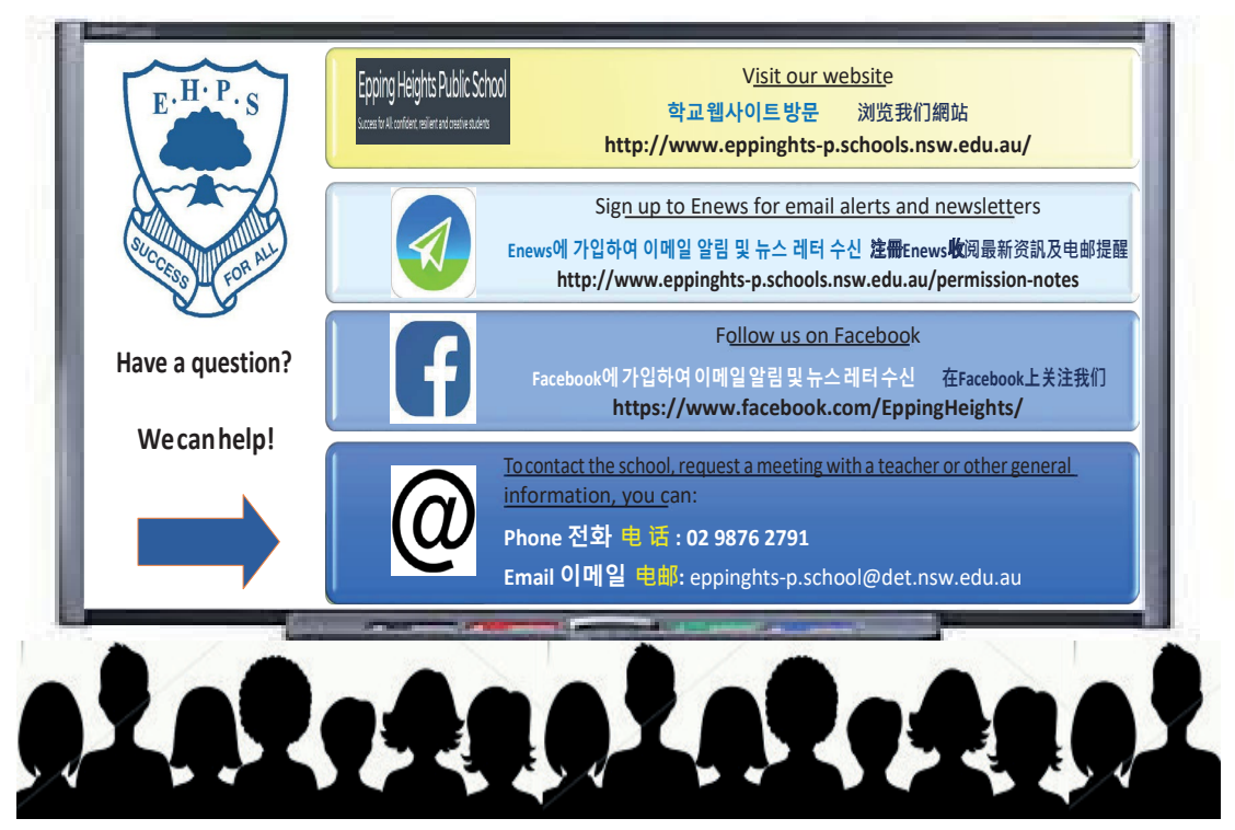
Community User Groups at Epping Heights PS

Did you know there are many extracurricular activities offered by private businesses at our school? Please contact the groups direct if you are interested in attending any of these activities.